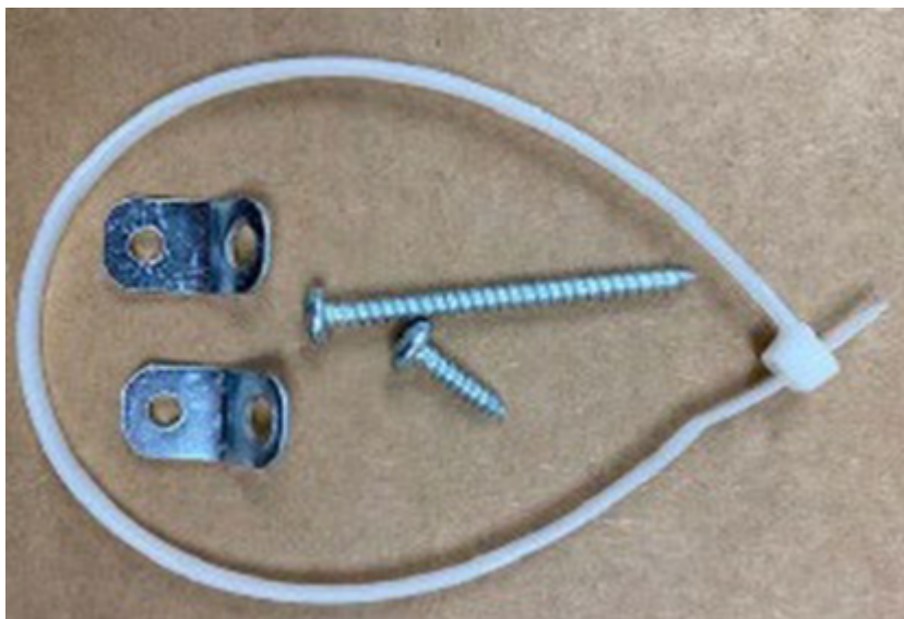
Recalled New Age tip restraint kit with plastic zip-tie, 2 brackets, and 2 screws